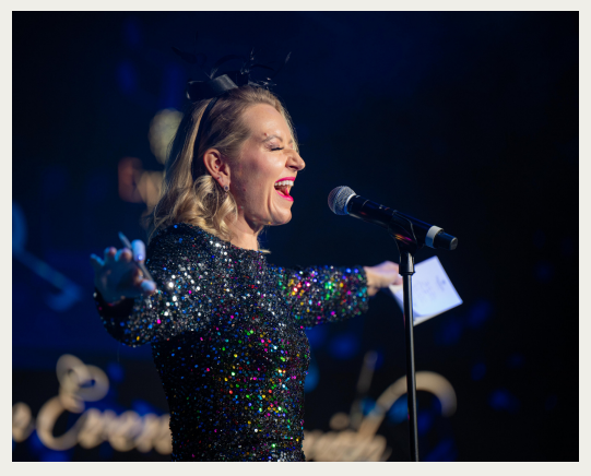
An Evening Experience X Explora Journeys (2023)