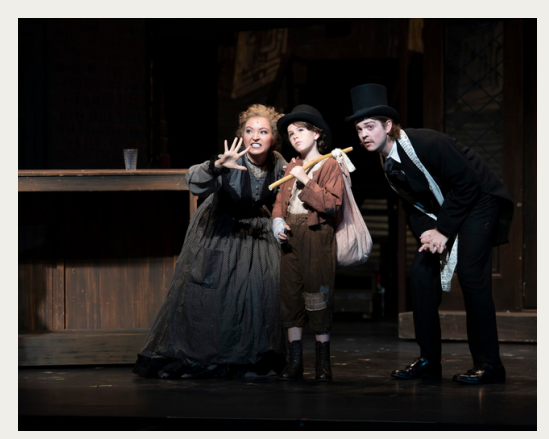
Oliver! X Utah Festival Opera (2023)