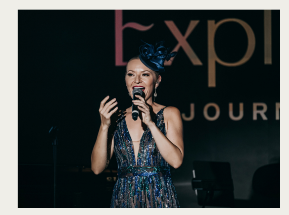
The Voice Within X Explora Journeys (2023)