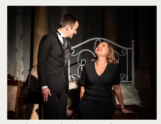
A Little Night Music X TheatreZone (2023)