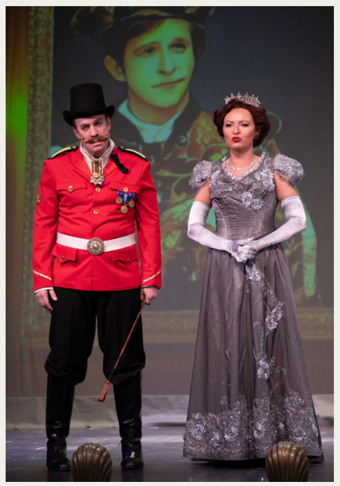
A Gentleman's Guide X Utah Festival Opera (2023)